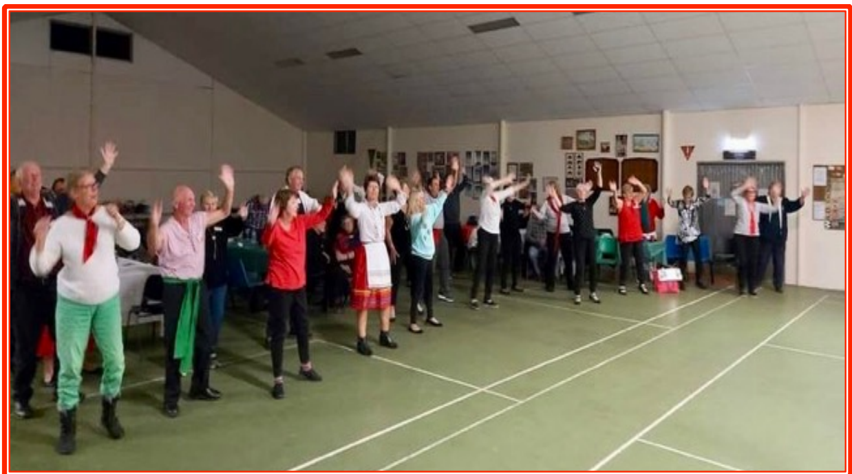
Sandgroper and Redgum Caravanners rockin' the night away in Wannamal.