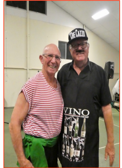
More photos of the fun and frivolity of the Italian themed evening in Wannamal