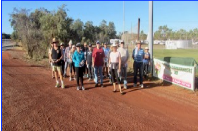
Early morning walkers enjoying the sunshine.

The joint rally with Redgum had been planned many months ago, and everyone had been looking forward to it. Redgum had 15 vans participating in the rally, and Sandgroper had 14 vans, a total of 55 people. Most turned up on Thursday, with a final few arriving on Friday. Thursday was a bit grey with a heavy shower during the afternoon, then all clear. The joint happy hour was a good chance for both clubs to mingle and get to know each other.