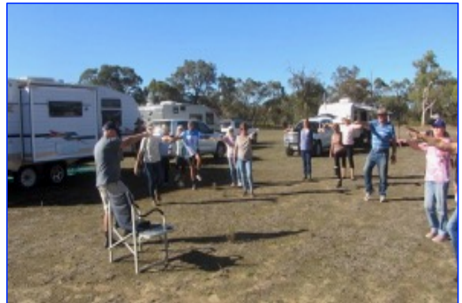
Redgums joined in Tai Chi.